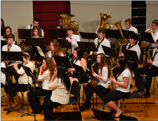
A high school concert band performing.

society is not limited to American culture, it is also reflected in many aspects of Canadian culture. Hamilton (2011) recalls the history of Canada's all Black segregated schools that were located in Ontario and Nova Scotia in the 1800's. She points out that while Black students were legally required to attend segregated schools, the history and culture of African-descended people were either being misrepresented or completely ignored in the general school curriculum (Hamilton, 2011). Hamilton goes on to suggest that when Blacks are left out of public schools, they end up segregating to their churches and communities, further perpetuating the marginalization of their cultural practices in relation to those of the dominant mainstream. This results in racial isolation, racialized categorization of 'other', and racialized identities continuing to be viewed as inferior (Hamilton, 2011). The silencing of Black history and culture in the curriculum has a direct association with the dominance of Eurocentrism in schools. The reproduction of the dominant culture's capital can be traced to the ideology of white supremacy.