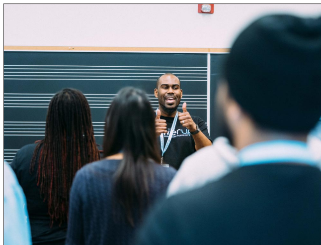
Chorale workshop at Toronto Mass Choir's PowerUp Gospel Music Workshop, York University, February 2019.